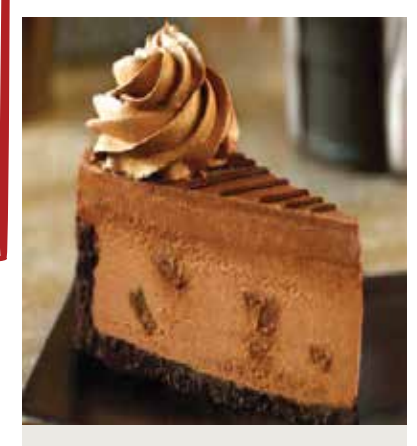
GODIVA® DOUBLE CHOCOLATE CAKE 7.75 Godiya® Cheesecake baked with chunks of milk chocolate topped with rich chocolate mousse, chocolate ganache and chocolate whipped cream.

IN 1972, THE CHEESECAKE FACTORY BAKERY® AND SPAGHETTI WAREHOUSE WERE FOUNDED ON A TRADITION OF EXCELLENCE, THE CORNERSTONE OF OUR CULTURES. WE ARE VERY PROUD TO BE SERVING THE CHEESECAKE FACTORY BAKERY® DESSERTS. WE HOPE YOU ENJOY EVERY DELICIOUS BITE FROM THIS ICONIC